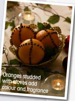
Oranges studded with cloves add colour and fragrance

And, of course, Christmas lunch isn't complete without a cracker or two. I like ones made from recycled paper or with eco gifts inside (biomelifestyle.com, £25 for six).