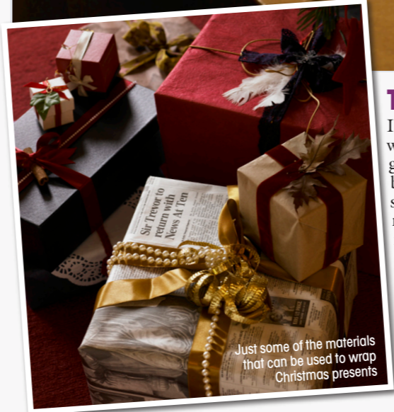
Just some of the materials that can be used to wrap Christmas presents