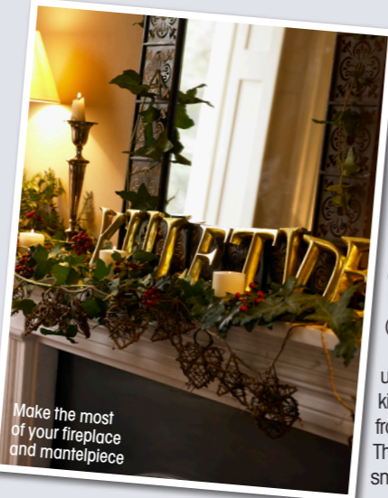
Make the most of your fireplace and mantelpiece

For me, the best thing about Christmas is the build-up to the